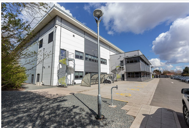
Beeswift, The Hub using the Opus 360