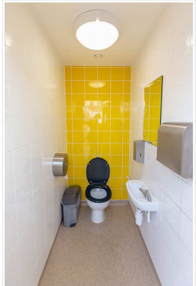
Weymouth Beach Facilities using the AMED IP65