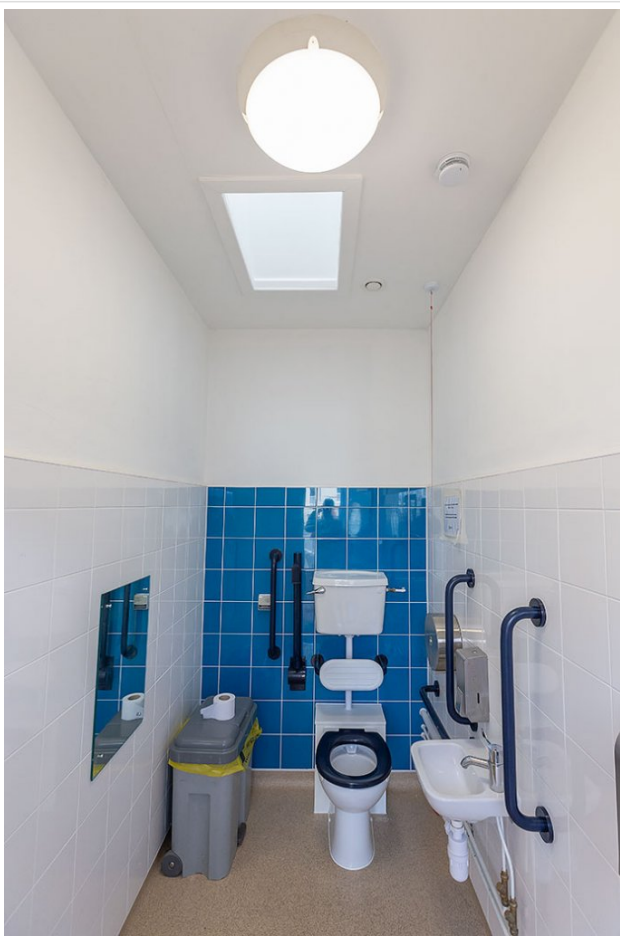
Weymouth Beach Facilities using the AMED IP65