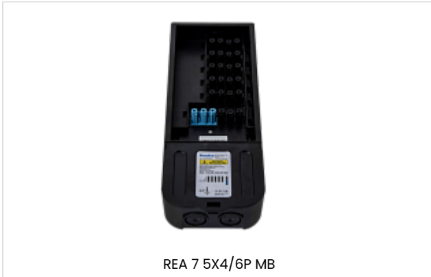
REA 7 5X4/6P MB